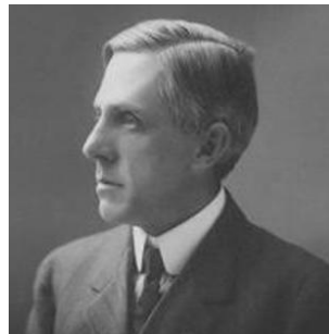
Ernest Lawrence Thayer was born on August 14, 1863 in Lawrence, Massachusetts.