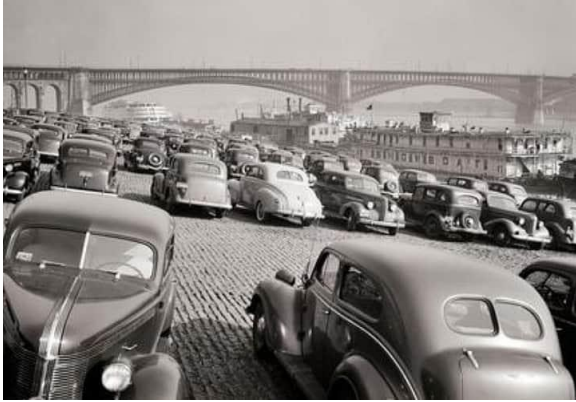
Riverfront in the 1940's.

MAY 11, 1927... Charles Lindbergh and "The Spirit of St. Louis" arrived at Lambert Field, 14 hours and 25 minutes after leaving San Diego. Lindbergh shattered the record for the 1,600 mile solo flight. He rested for a day before taking off for New York, and still managed to set a record for a solo coast-to-coast flight. On May 20 th , he left for Paris.