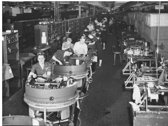
Manufacturing gun turrets.

GLIDER CRASH August 1, 1943 - 77 years-ago today, ten people, including the